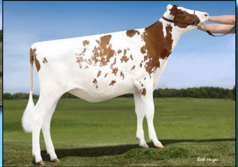
Joesy-LLC Oly Subaru-Red-ET Dam of Lot 6

Troy Alexander 1710b E 7750s Rd Chebanse, IL 60922 216/879-3426