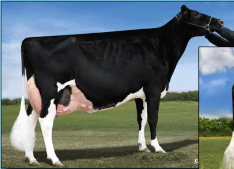
Silvermaple Damion Camomile (EX-95 EEEEE) 2nd Dam of Lots 25 & 26