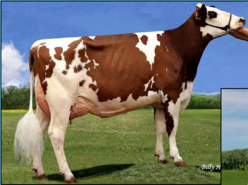
Mapel Wood Epic Giggle-Red (VG-89 EX-MS) 2nd Dam of Lot 3