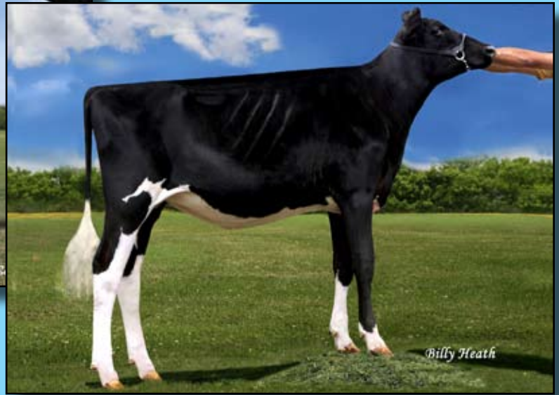
Butlerview Armani Coach-ET Dam of Lots 25 & 26