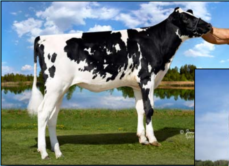
IHG Flame Elsa 9173-ET Dam of Lot 8