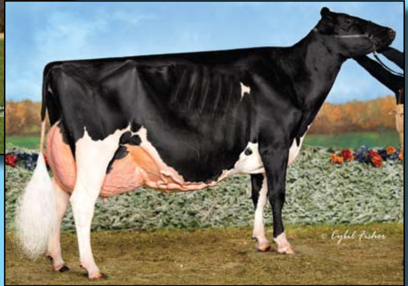
Lovhill Goldwyn Katrysha (EX-96) Dam of Lot 1 & 2nd Dam of Lot 30