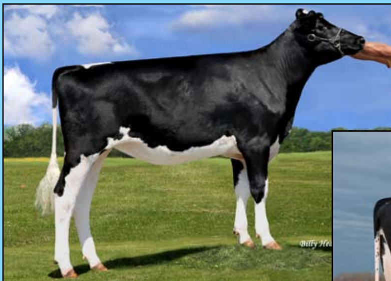
Rugg-Doc Sprshot Chainey-ET Dam of Lot 11