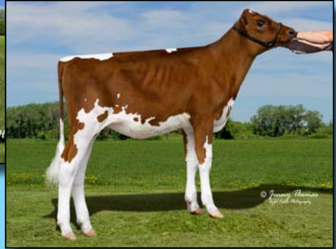
Ri-Val-Re TG Crimson-Red-ET Dam of Lot 3