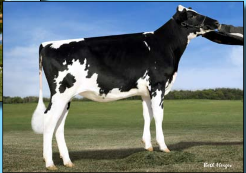
Farnear Ellie Elsa-ET 2nd Dam of Lot 8