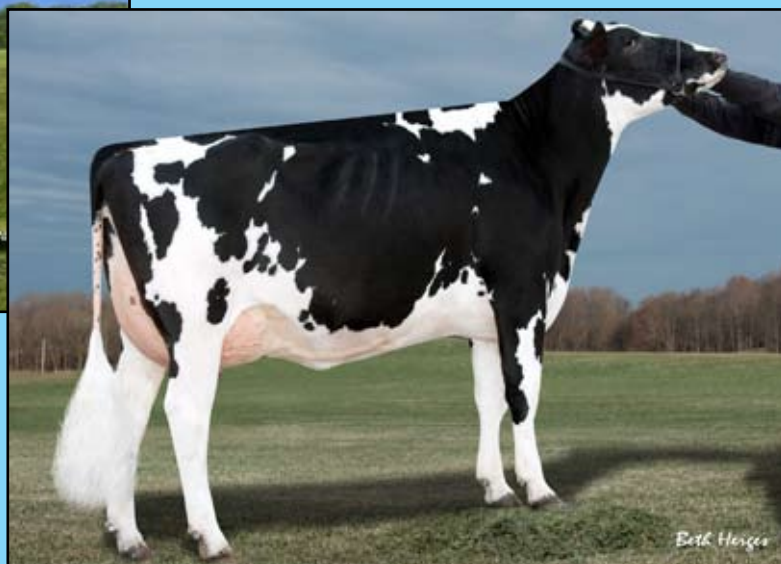
Ms Rugg-Doc Arms Chipper-ET (EX-91 GMD DOM) 4th Dam of Lot 11