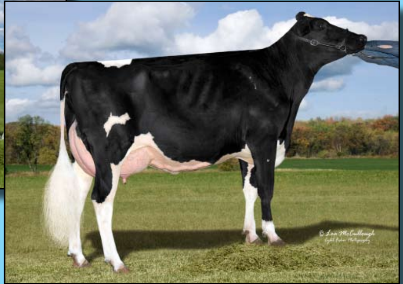
Cookiecutter MOM Halo-ET (VG-88 EX-MS DOM) 2nd Dam of Lot 2