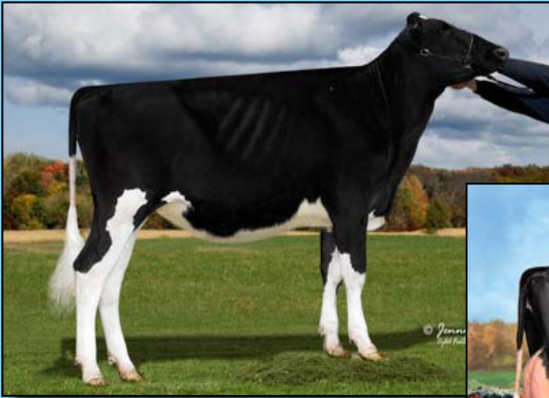
Miss Kats Knockout-ET Dam of Lot 30 & Maternal Sister to Lot 1