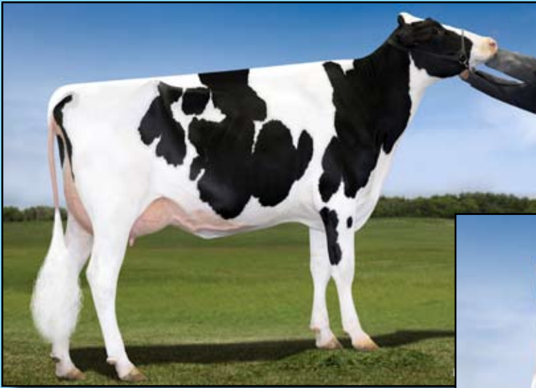
De-Su Uno 3081-ET (VG-85 VG-MS, 2y) Dam of Lot 4