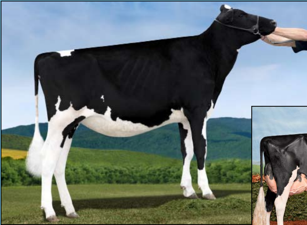
Jacobs Doorman Beldora-ET Dam of Lots 18 & 19