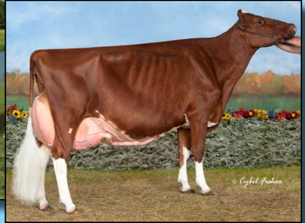
Ms Apple Akeeva-ET *RC Dam of Lots 28 & 29