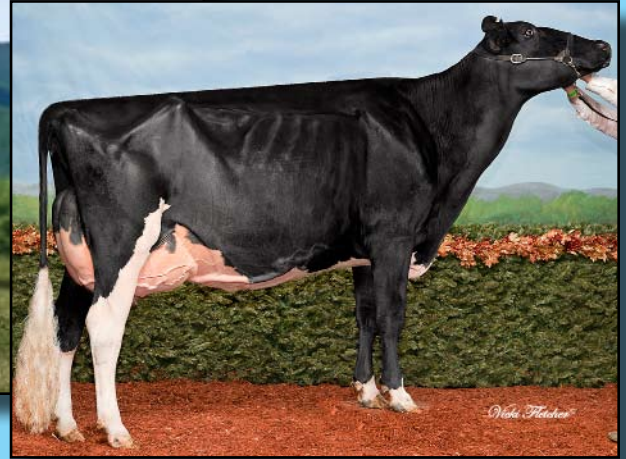
Jacobs Goldwyn Britany-ET (EX-96-2E CAN 2*) 2nd Dam of Lots 18 & 19