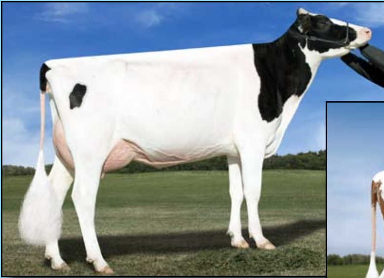
Des-Y-Gen Planet Silk-ET (EX-90 EX-92-MS) 3rd Dam of Lot 6