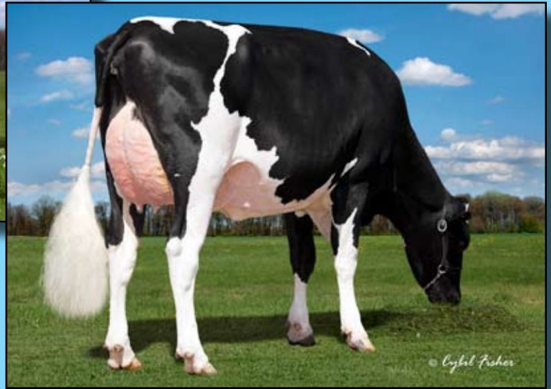
Golden-Rose Raspberry-ET (EX-90 EX-MS) Dam of Lots 16 & 17