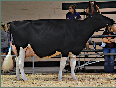
Savage-Leigh Gold Lona EX-92-USA Winning Grand Champion honors at the 2013 Maryland State Fair