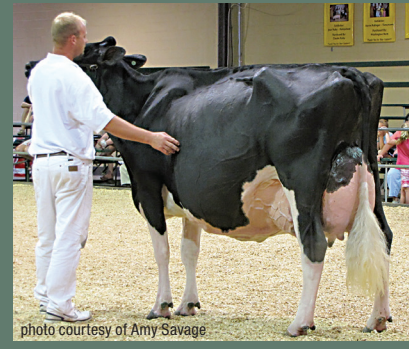
Savage-Leigh Leona EX-96 2E Winning Supreme Champion at the 2012 Maryland State Fair