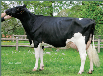
DKR Sandy-Valley Lexus VG-85-NL Sold through the Eurogenes Online Heifer Sale for €13,000

It has already been mentioned but family members of Licorice have sold for high prices at many sales. The highest one is Savage-Leigh Lavisha (s. Toystory) who sold to Ludwig Farms, Ill. during the International Intrigue 2009 for $340,000. Her full sister sold at the Field of Dreams Sale for $48,000 to Stanton Bros Ltd, Ontario. At the Stars of Savage-Leigh 2007, Savage-Leigh Allen Leola sold for $70,000 and at the Global Glamour Sale 2008 a Shottle daughter, Savage-Leigh Lola EX-93-USA, from Licorice sold for $150,000.