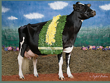
Savage-Leigh Licorice EX-92-USA GMD DOM Grand Champion, New York Spring International Show 2006