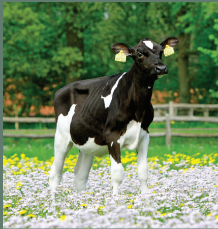
Bouw Shamrock Lizette GTPI+2275 (8/13) Shamrock x DKR Sandy-Valley Lexus VG-85-NL (above) Former No. 1 GTPI heifer in Europe and sold for €65,000 in the Holland Masters Sale 2012.