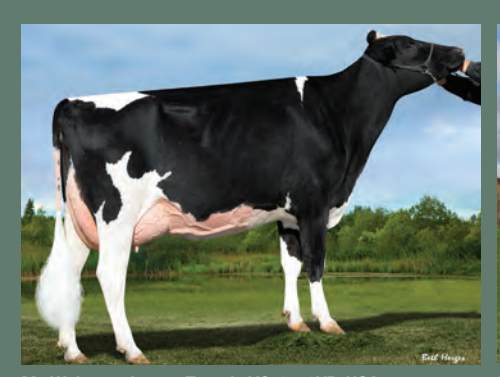
Ms Welcome Latroy Temple VG-85-2YR-USA +2653G Halogen son at Select Sires