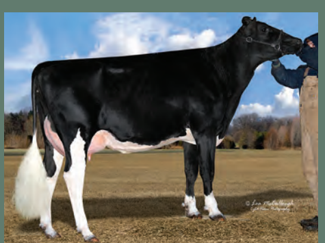
Ms Welcome Hill Tobi VG-85-2YR-USA Full sister to Tango at Genex / Dam of Teton-P at ABS Global

line that will develop most here at Welcome Stock." Which seems realistic since Tarina already has 13 offspring over +2500 GTPI, including two sons and three daughters over +2600.