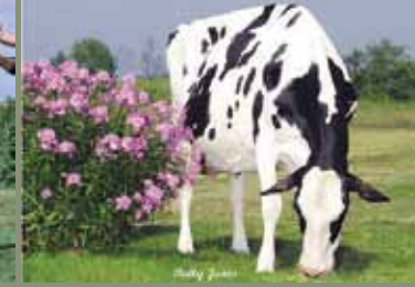
Brigeen Integrity Robin EX-95-USA 2E Gloryland Liberty Rae EX-95-USA One of the highest scored Integrity dtrs in the breed Liberty Rae sold for $ 410.000

EX-90 and VG-87) and two bulls, named Scientific Deuce *RC EX-90 and Dusk *RC EX-94. Both sampled through Select Sires and succeeded in making a big impact with both still being in the U.S. TPI Top 20 and PTAT Top 10 for Red & Whit (12/10). This successful bull line looks like it will continue with great promise for the future with Scientific Debonair EX-90, sired by Talent and at Select Sires. Debonair has a PTAT of +2.55 and have been heavily used in Red & White show breeding.