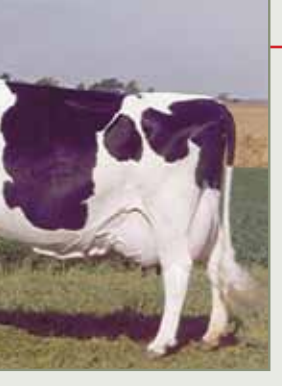
SA 4E GMD ne x VG-USA Sovereign)

O Our-Favorite Detox RC, Duhlux RC & Dallas RC (s. Picston Shottle)