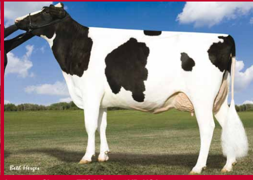
Larcrest Chenoa-ETS VG-86-2YR-USA The next generation of contract cows at Larcrest Holsteins!

greatness she has completed through breed leading sons and daughters around the world, she is pregnant and will calve again and improve in everything. What a special cow," Culbertson said.