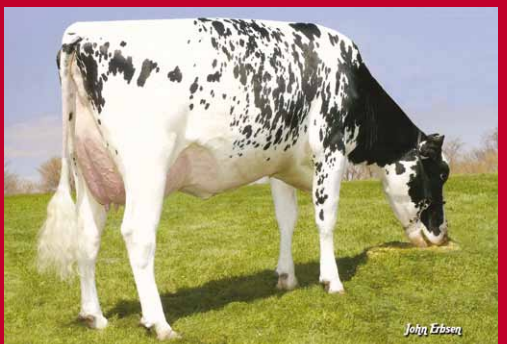
Larcrest Cosmopolitan VG-87-USA DOM One of the greatest Shottle daughters with numerous high sons!