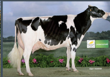
Agathe VG-88-FR Int. Champion SIA Paris '10 - Dam to Emeraude