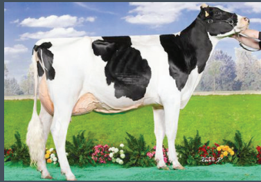
Danoise VG-87-FR 2yr. Dam to Cabon Fernand @ Semex