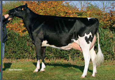
Carf Emeraude VG-89-NL 2yr. National Jr. 2-Yr. Old Champion & +18 g Conf.!