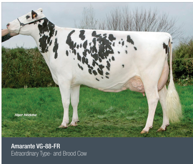
Amarante VG-88-FR Extraordinary Type- and Brood Cow

The French had already known for several years that this family was special and now the rest of us are also aware that it's not only one of the very best families in France, but also competes with the best families in the World! The family really caught the global spotlight with Cabon Fernand at Semex who is seeing international use as a sire of sons, and with the 2011 French National 2yr-old Champion Carf Emeraude VG-89 2yr, later sold to the Netherlands.