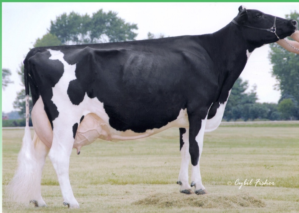
Willows-Edge Star Maiden EX-93 Stardust x Charles x Valedictorian Nominated Junior All-American Aged Cow 2005 Junior All-Wisconsin Aged Cow 2005 Reserve Junior All-American 5-Year-Old 2004 Junior All-Wisconsin 5-Year-Old 2004

Pine-Tree had 30+ additional cows scored VG-85 or higher!