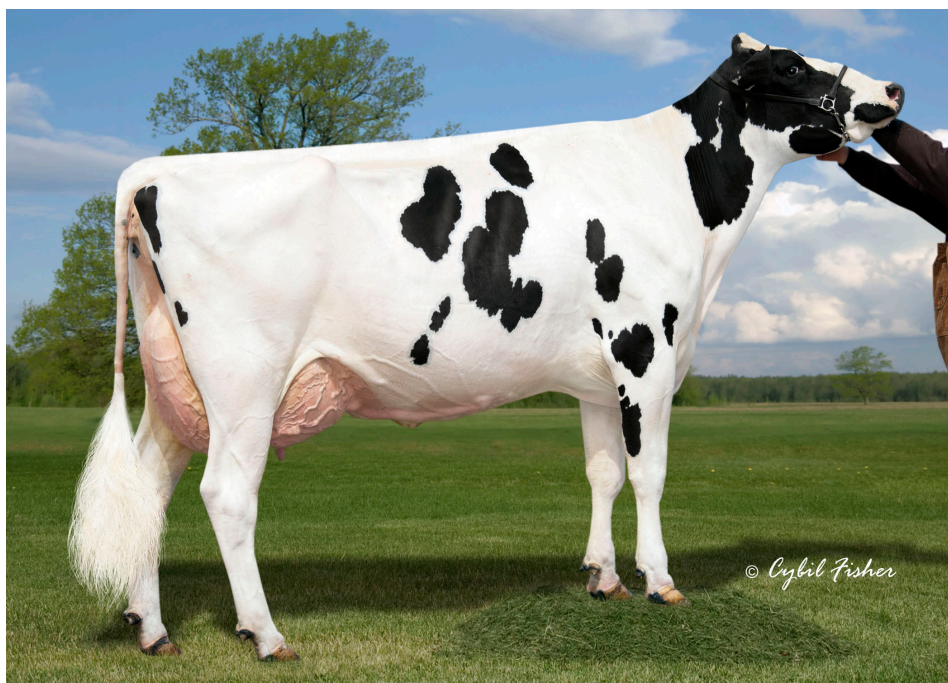
Willows-Edge Bolton Flicker EX-94 Bolton x Outside x Skychief Grand Champion, WI District 1 Holstein Show 2014 Dam of Multiple Bulls in AI & Many Successful Females