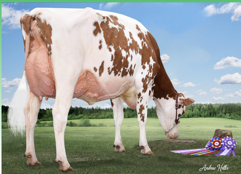
Lake-Breeze Def Careful-Red EX-92 Defiant x Absolute-Red x Kite Grand Champion, WI District 1 Holstein Show 2019 CURRENTLY ON A FLUSH PROGRAM