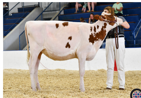
WILLOWS-EDGE UN MAYBESO-RED