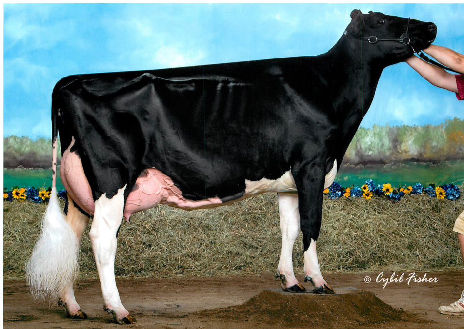
Willows-Edge Advent Malika EX-94 Advent-Red x Integrity x Stardust Reserve Junior All-American 4-Year-Old 2011 Champion Bred & Owned Female, Grand National Junior Show 2011 Reserve Junior All-American 3-Year-Old 2010 Grand Champion, Midwest Fall National Junior Show 2010 Reserve All-Wisconsin Junior 2-Year-Old 2009

1515 Livingstone Road, Suite B, Hudson, Wisconsin 54016, USA