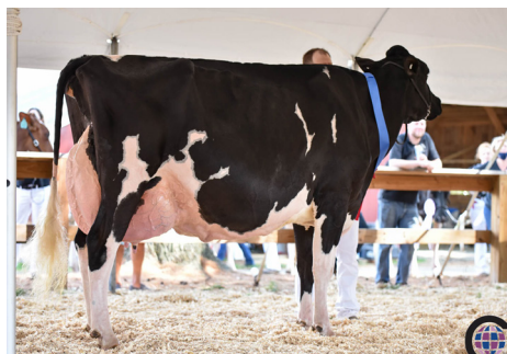
OAKFIELD REALITY HARMONY